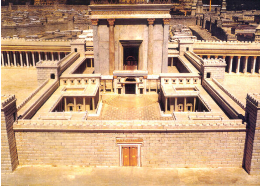
Figure 2: The Temple of Solomon

The Temple of Solomon was a magnificent structure, built by King Solomon in Jerusalem. It was a place of worship and a symbol of God's presence among His people. The temple was built on a hillside, and its architecture was a blend of Canaanite and Egyptian styles. The temple was made of gold, silver, and precious stones. It had a large courtyard and a central sanctuary. The temple was destroyed by the Babylonians in 586 BC, but it was rebuilt by King Darius in 520 BC. The temple was a place of worship for the Jews, and it was a symbol of their faith. The temple was a place where God's presence was felt, and it was a place where people came to worship Him. The temple was a place of hope and a place of faith. The temple was a place where God's love was shown to His people, and it was a place where God's mercy was felt. The temple was a place where God's grace was given to His people, and it was a place where God's mercy was shown to His people. The temple was a place where God's love was shown to His people, and it was a place where God's mercy was felt. The temple was a place where God's grace was given to His people, and it was a place where God's mercy was shown to His people.